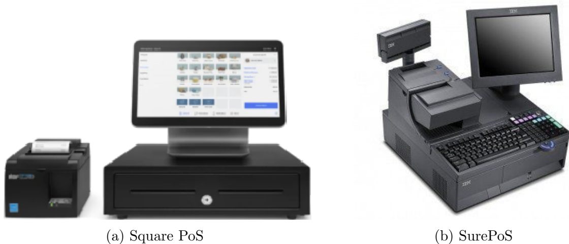
Figure 1.1: Comparison of common PoS systems

For instance, a common thermal printer seen with PoS systems, integrated with fuel pumps, or other industrial control equipment, is the SNBC BTP-S80 thermal printer [6], [7]. There are multiple versions of the device with support for Bluetooth, USB only, or combination of USB/Serial/Ethernet. The bluetooth hardware is provided over an accessory 25-pin serial connection, with more I/O as a serial connection via RS232C connector and USB Type-B. It has driver support for various platforms: Android, iOS, Windows, Linux, and MacOS. The most interesting aspects are the processor, an Arm Cortex M4 clocked at 3.54MHz, and the operating system, a proprietary version of FreeRTOS. The system architecture is Armv7E-M with JTAG/SWD hardware debugging support [8], [9].